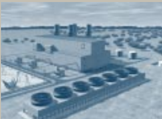
IC Systems Expansion