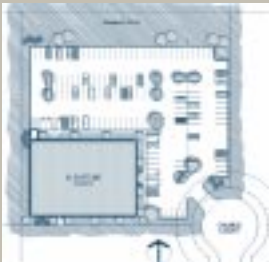
Golden Grain Energy