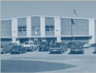
Sunny Fresh Foods