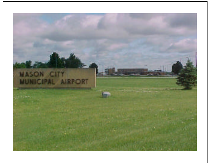
Mason City Municipal Airport

The airport has multi-services available to the public including the